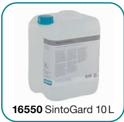
16550 SintoGard 10L