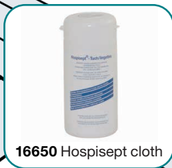
16650 Hospisept cloth