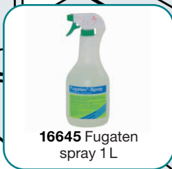
16645 Fugaten spray 1L