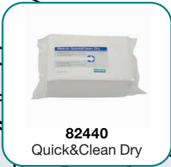
82440 Quick&Clean Dry